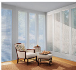
Hunter Douglas Window Fashions